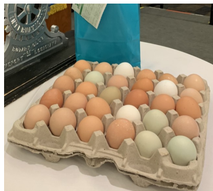
From famine to feast! Andy Shehee's ameraucana hens are now producing like crazy!