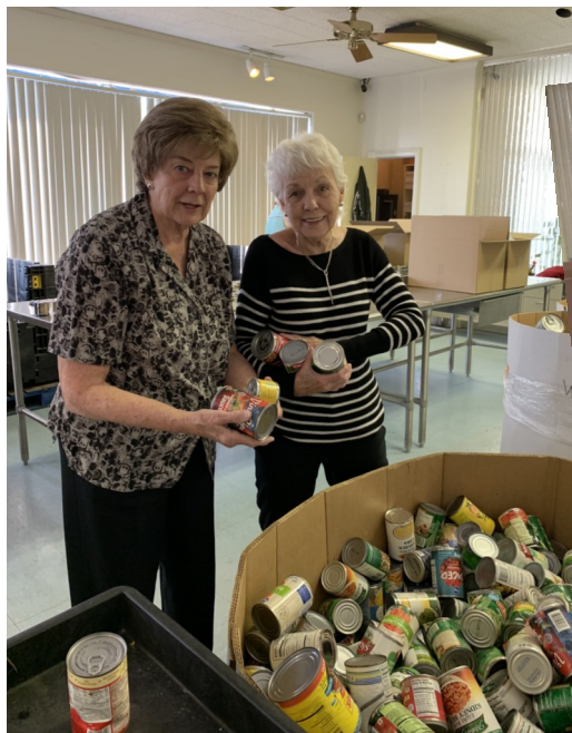
More Food Bank volunteers